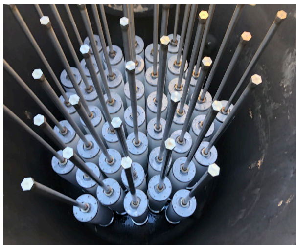
Figure 3. Upgraded housing.

The upgrade involved the improvement of aerosol capture efficiency of the elements, improvements in the ability to disengage and remove the captured liquid, improvements in flow dynamics to minimise the potential for re-entrainment, and enhancement in the