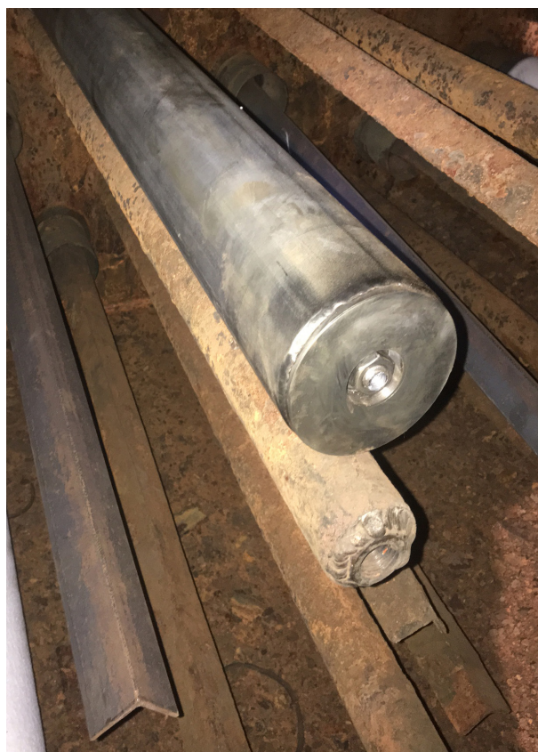
Figure 4. Internals of reformate/chloride separator showing existing risers.

sealing mechanism of the elements. Figure 1 shows the housing, and Figure 2 shows the conventional elements, and the damage experienced by these elements.