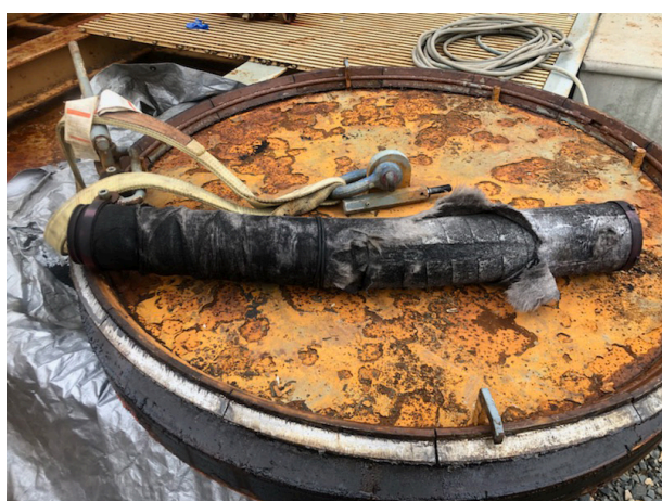
Figure 2. Conventional coalescer element used in the inlet separator. The damage suffered to the element is apparent.