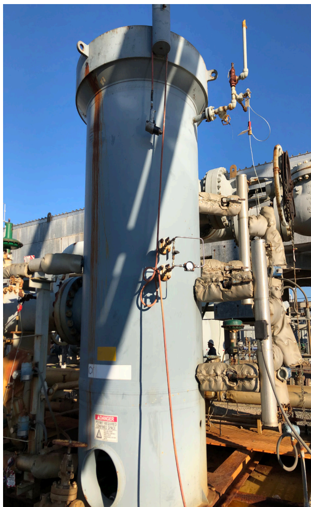
Figure 1. Inlet separator to an amine treater.