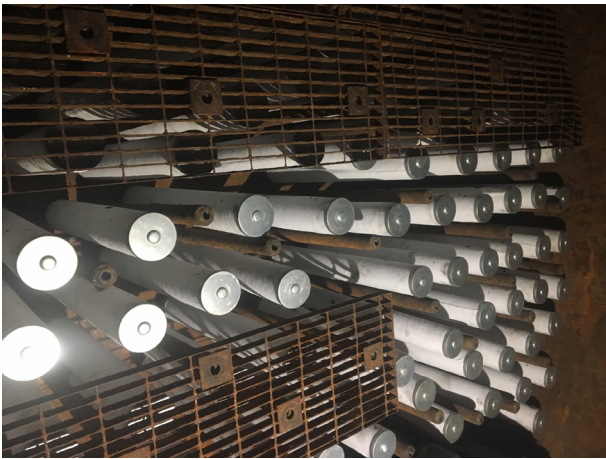
Figure 5. Upgraded internals showing new emulsion separation elements installed.